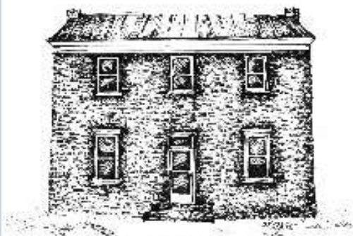
BLAND COUNTY JAIL ESTABLISHED 1866

Mailing Address: PO Box 416 Bland, VA 24315 Email: info@blandcountyhists.org